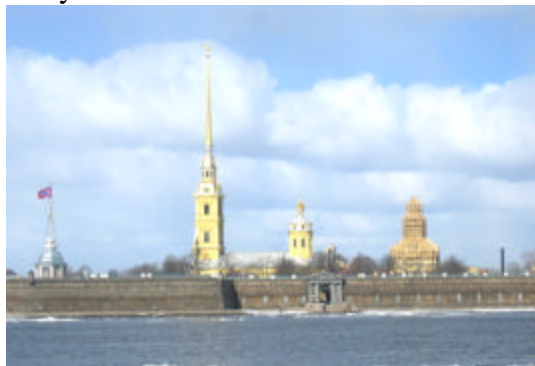
Peter and Paul Fortress, St. Petersburg

Estimated cost without scholarship: $4999. For some students, regular student financial aid support can be increased due to the additional cost of studying abroad. See the Office of Study Abroad for a program budget and referral to Student Financial Aid staff who assist study abroad students.