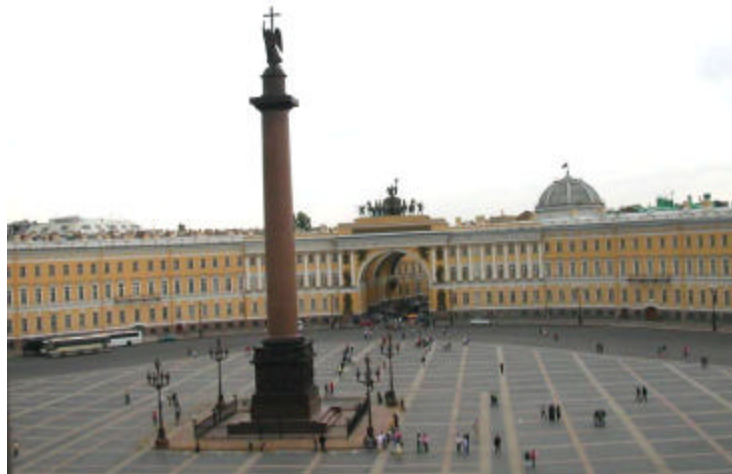
Alexander Column and Palace Square, St. Petersburg

Not included: passport, health and travel insurance, some meals, non-group transportation and personal expenses.